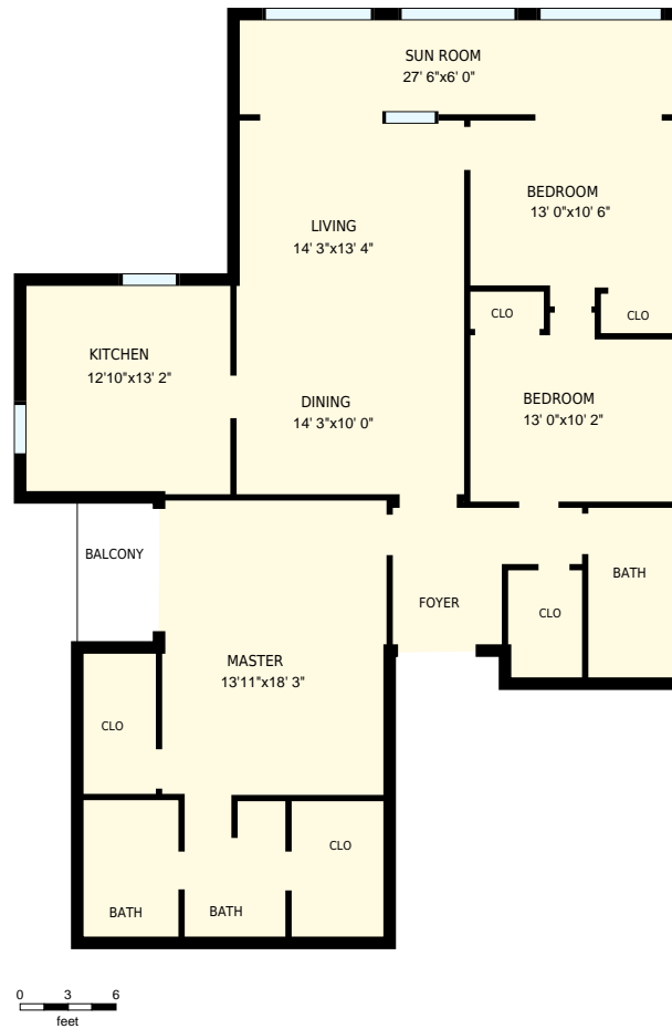
Main Floor Exterior Area 1782 sq. ft.

Total Exterior Area Above Grade 1782 sq. ft.